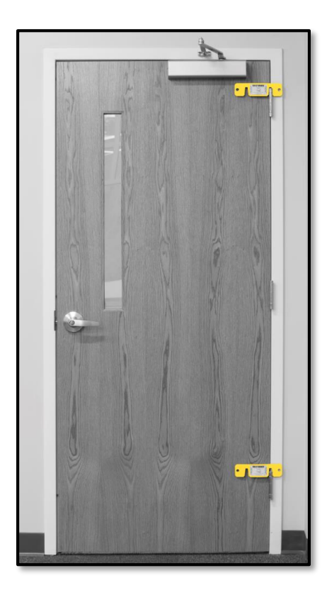
Double Brakes-Better Defense