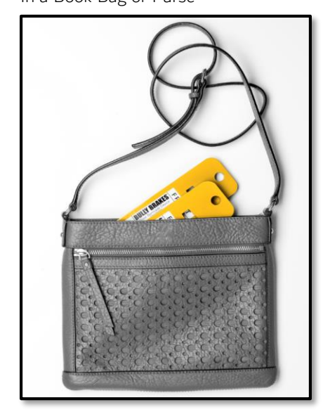
In a Book Bag or Purse