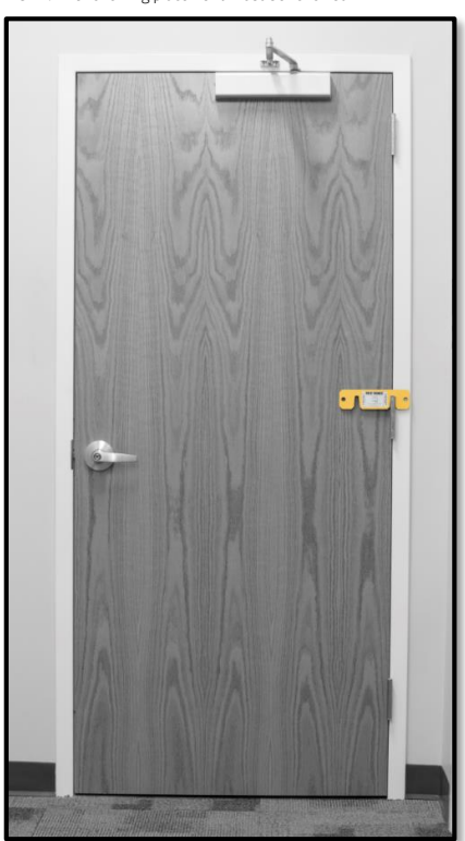
Single Brake-Good Defense NOTE: The following placement must be followed