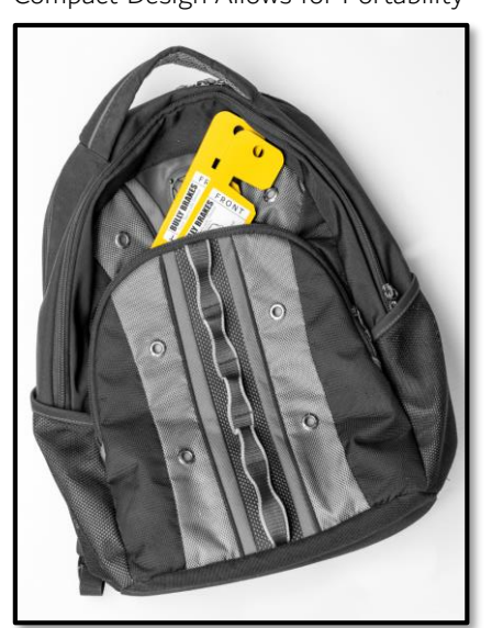
Compact Design Allows for Portability